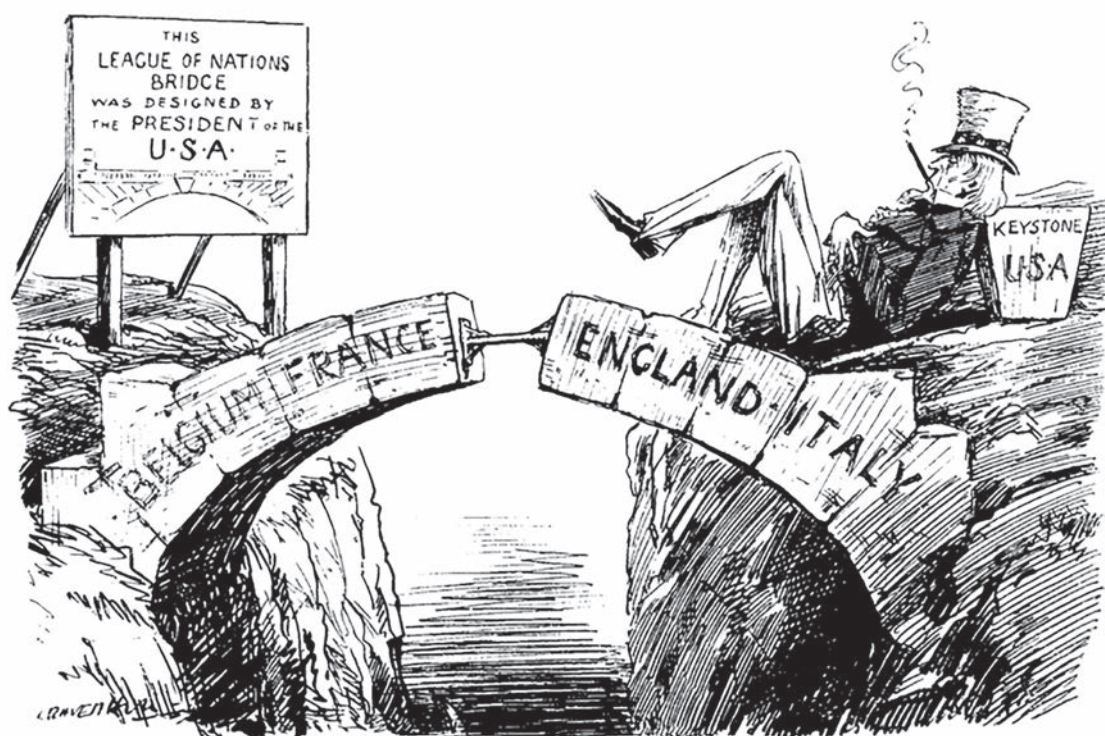
THE GAP IN THE BRIDGE.

A cartoon published in a British magazine, December 1919. The keystone is the stone that locks the structure together.