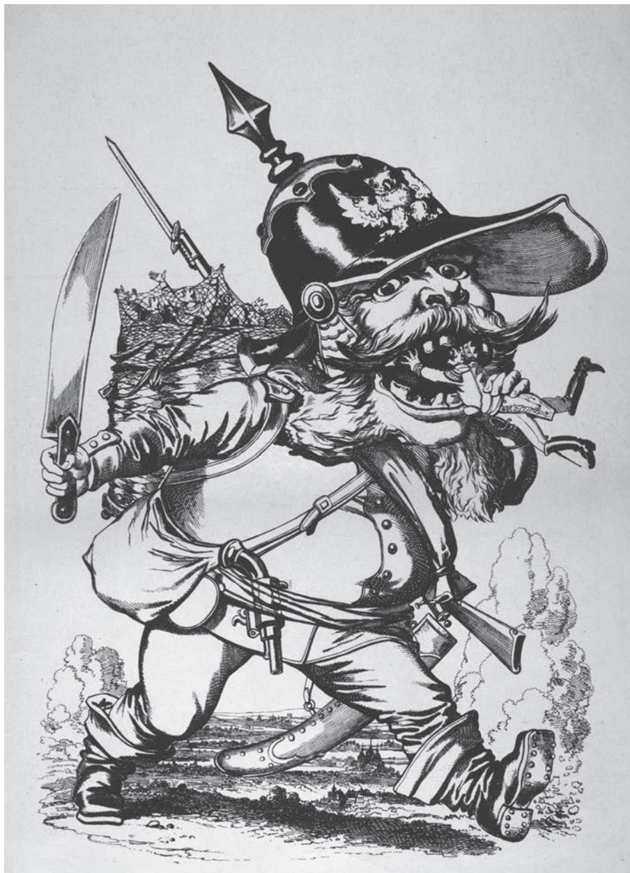
A French cartoon published in early 1867. It is entitled 'The Giant German Ogre'. It shows William and some small figures which represent the princes of North Germany.