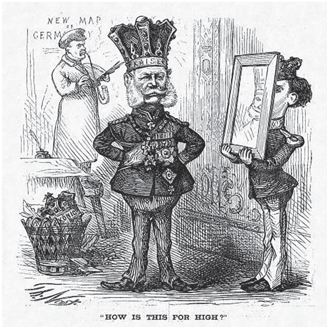
A cartoon published in an American magazine, 7 January 1871. Bismarck is in the background. William's Prussian crown lies in the waste bin.